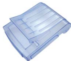
Spill proof cover